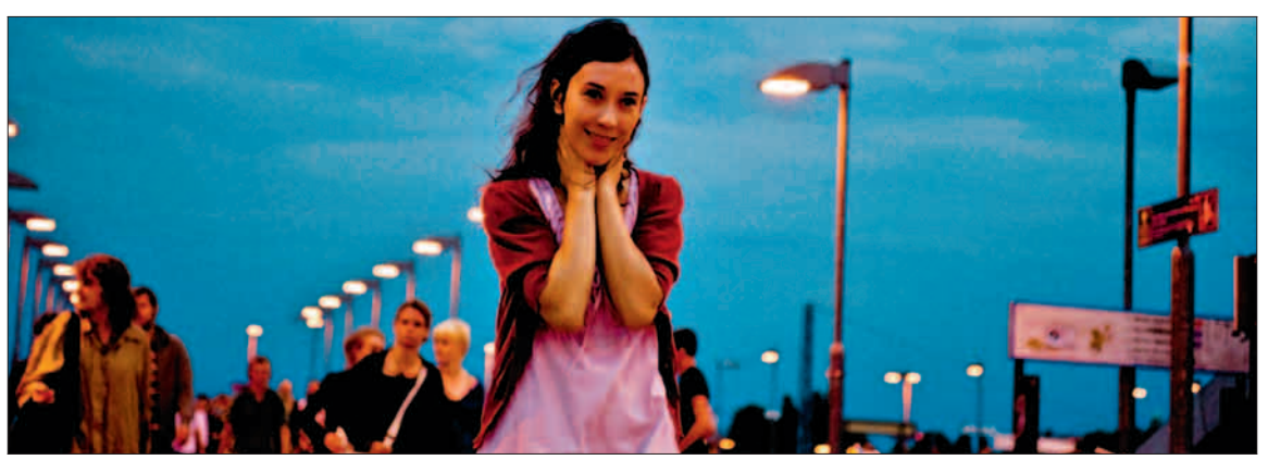
Actress Sibel Kekilli seen in a scene from Feo Aladag's When We Leave - being screened as part of the Kino festival

As in recent years, the latest edition of Goethe-Institut Hongkong's annual Kino film festival offers a wide range of films across a variety of genres and topics.